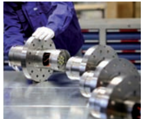
Measurement of glass-to-metal sealed penetrations for PWR and BWR