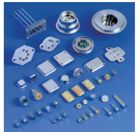
Feedthroughs for pressure, flow and humidity sensors

70049 ENGLISH 02100.3 all/jab Printed in Germany No responsibility can be taken for the accuracy of this information. Despite the fact that all reasonable care was taken in presenting and keeping this information up to date, SCHOTT neither accepts legal responsibilities nor guarantees the completeness, accuracy and up-to-dateness of the information presented here. Date issued: February 2010