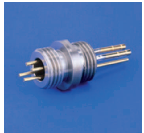
Feedthrough for humidity sensors