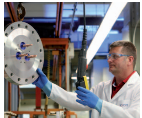
Plating of large-scale electrical feedthrough for LNG vessels

For more information: www.schott.com/epackaging